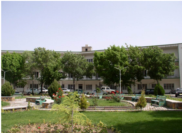
Public relation of Nikookari Educational and treatment center